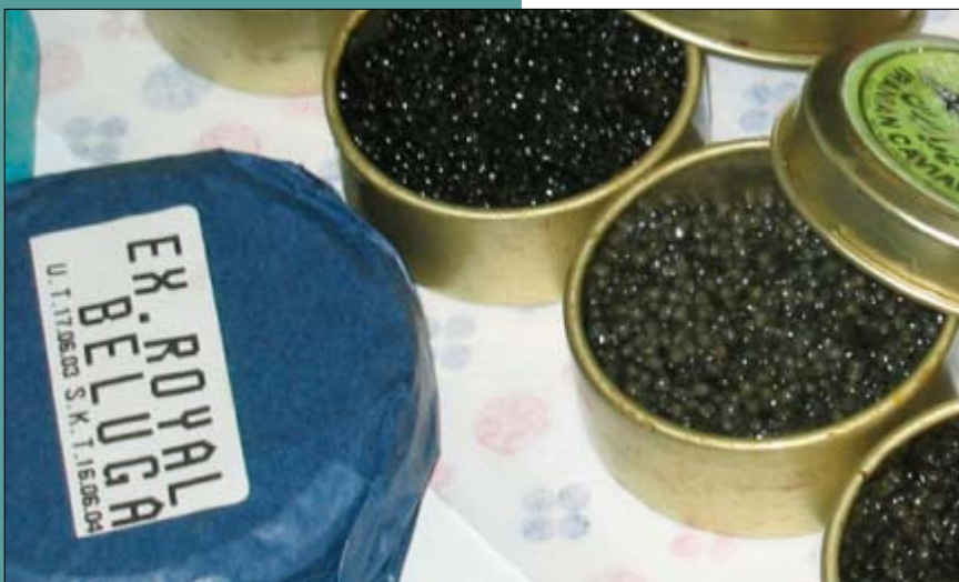
Beluga caviar can fetch retail prices of up to EUR 600 per 100 g.

It is therefore essential that everyone involved in the trade and marketing of caviar (including importers, exporters, wholesalers, retailers, restaurants and travel businesses, such as cruise ship operators, airlines and luxury hotels) are aware of the labelling requirements so that all can adequately implement and comply with the new